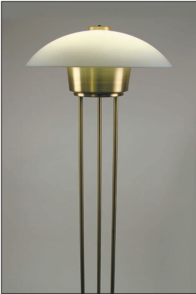
Shown in Satin Brass