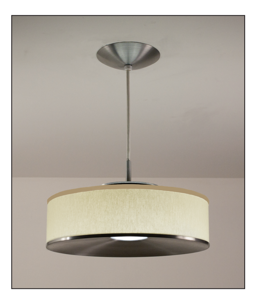
Shown with cream linen shade.