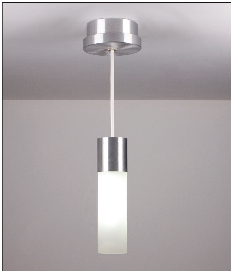
356 shown in Satin Aluminum.