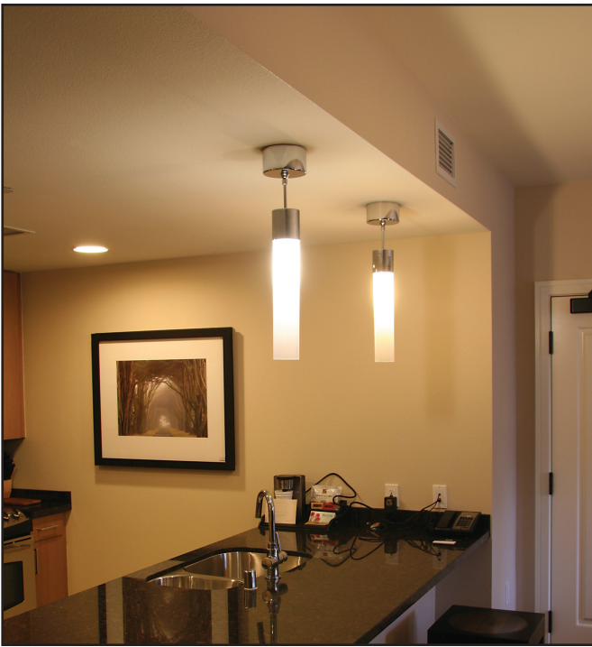
Verasa Resort Napa, CA INT DES: CHIL