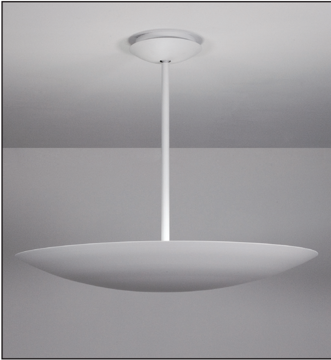
Shown in Matte White with 24" hang height