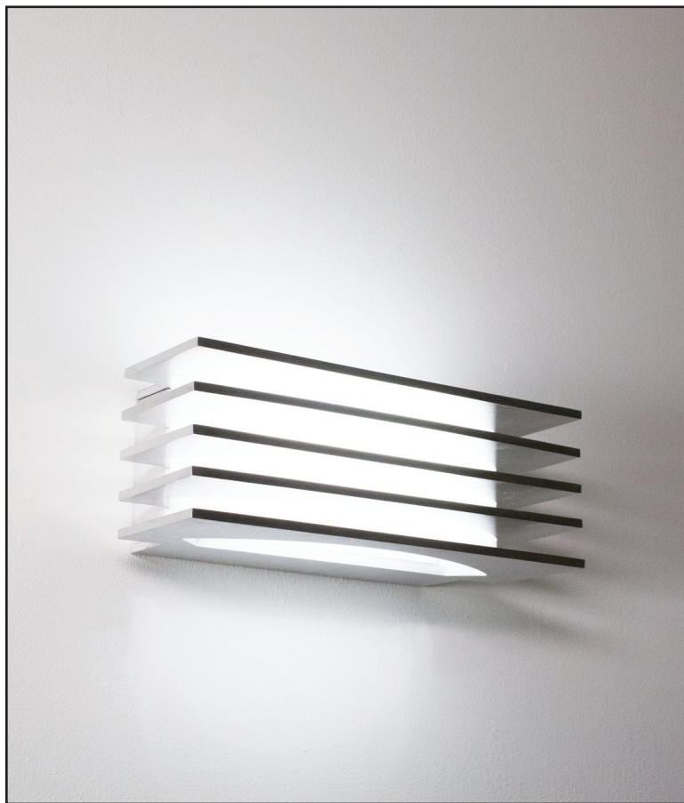
Shown with Satin Aluminum.