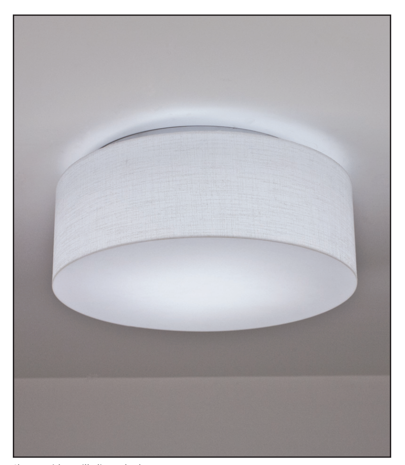
Shown with vanilla linen shade.