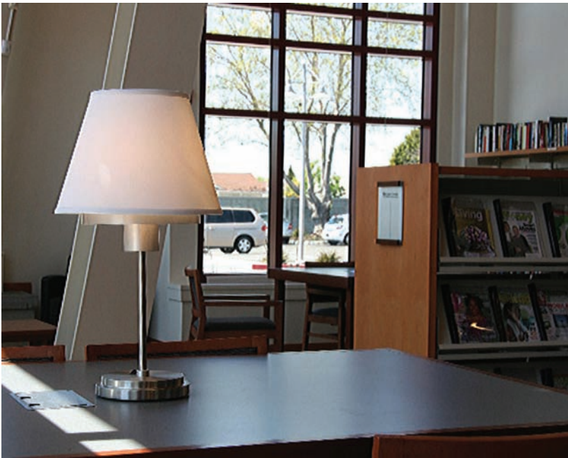
PROJECT: Manor Branch Library - San Leandro, CA ARCH: FORM4 Architects - San Francisco, CA